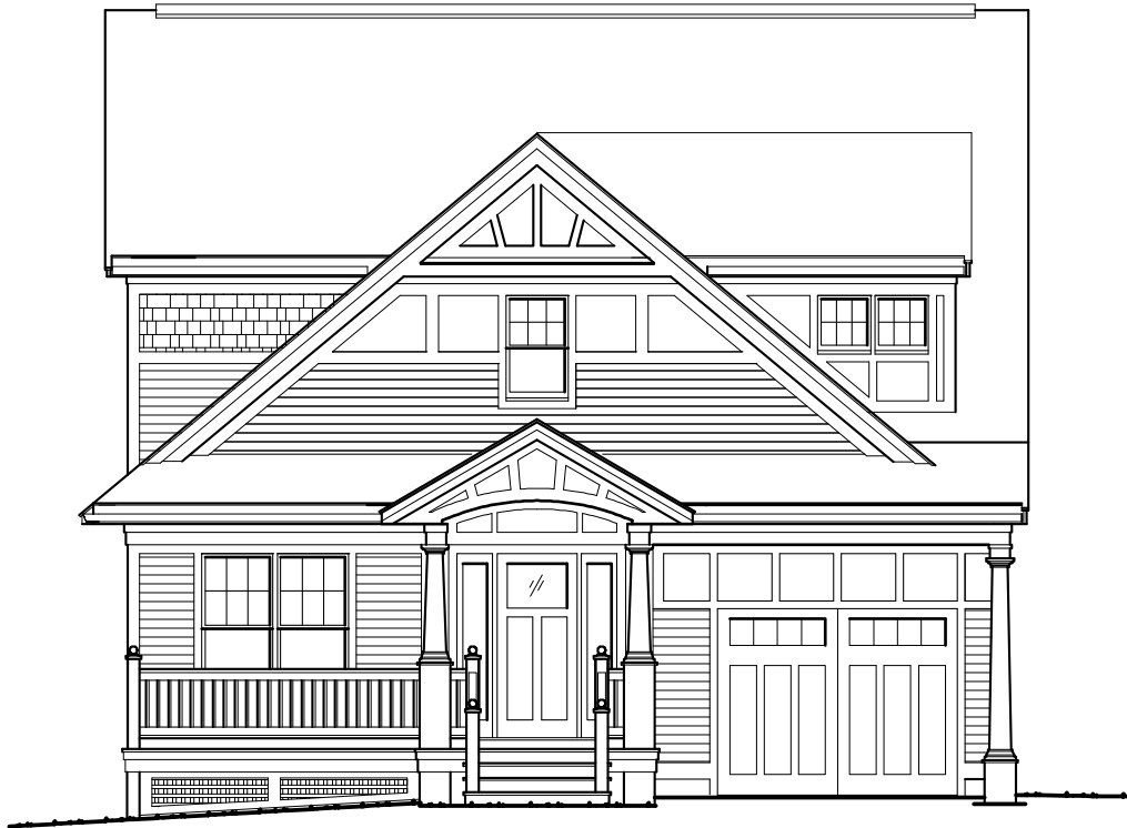
PLAN TYPE - "B-2" FRONT ELEVATION