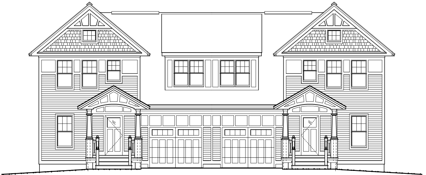
PLAN TYPE - "C" - Duplex FRONT ELEVATION